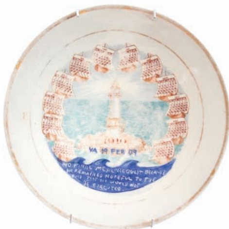
Clockwise from Top Left: Texas, 27 June 2006; South Carolina, 18 March 2004: A bottle of Dom Perignon [request not granted]; Oklahoma, 27 April 2000: Catfish, French fries, plums, grapes, strawberry shortcake, and Sprite soda; Oregon, 6 September 1996: 5 fried eggs (sunnyside-up), hash browns, bacon strips (crisp), stack of pancakes with syrup, hot coffee, milk, and cold orange juice; Virginia, 19 February 2009; Texas, 12 September 2006: Four olives and a bottle of wild-berry-flavored water.